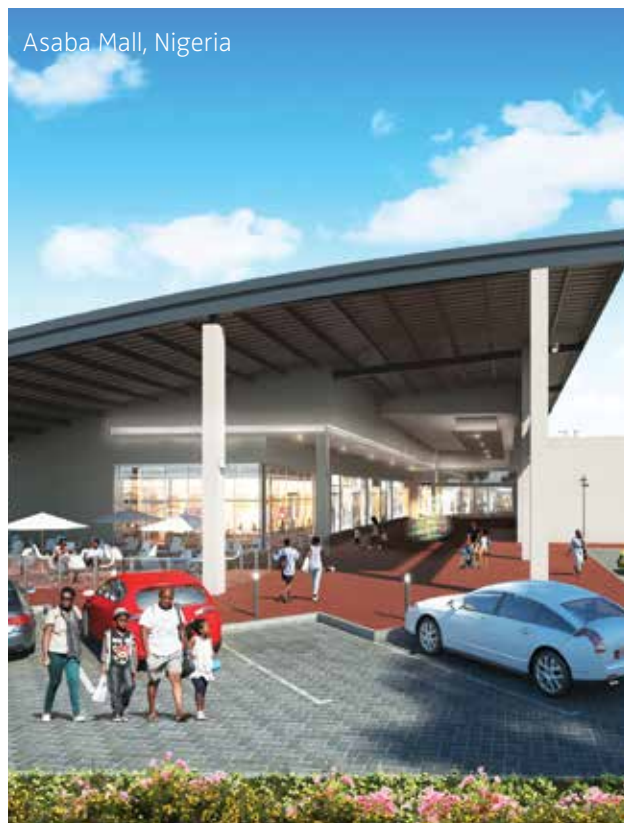
Asaba Mall, Nigeria

Project Name: Silver Valley Mall Location: Port Harcourt GLA (m 2 ): 13,000 Expected Trading Date: August 2018 Anchor Tenants: TBC