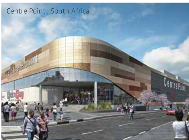
Centre Point, South Africa

Project Name: Emfuleni Mall Location: Free State GLA (m 2 ): 8,000 Expected Trading Date: March 2018 Anchor Tenants: Shoprite