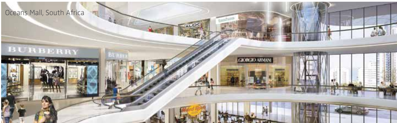
Oceans Mall, South Africa

Project Name: Fourways Mall Location: Gauteng GLA (m 2 ): 85,000 (redevelopment and extension. Total GLA: 170,00m 2 ) Expected Trading Date: April 2018 Anchor Tenants: Relocating and expanding all major national fashion retailers as well as adding new international brands