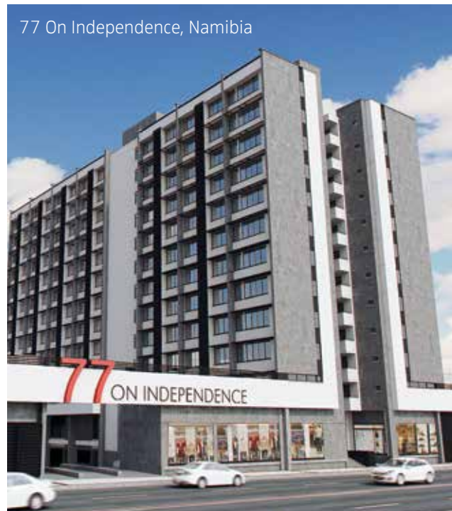
77 On Independence, Namibia

Project Name: Ellis Park Mall Location: Okakarara GLA (m 2 ): 16,800 Expected Trading Date: Late 2018 Anchor Tenants: Grocery, hardware outlet and car dealership