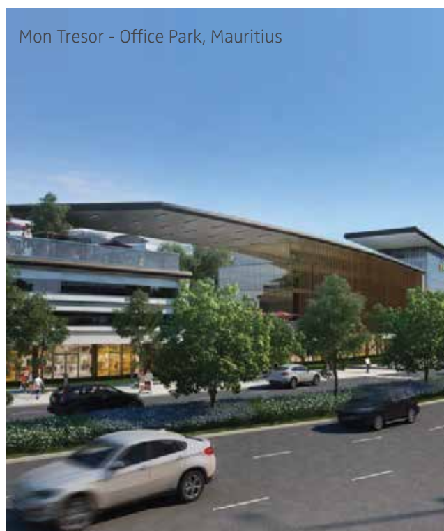
Mon Tresor - Office Park, Mauritius

Project Name: Cascavelle Shopping Village Location: Bamboo (redevelopment) GLA (m 2 ): TBC Expected Trading Date: Trading Anchor Tenants: Monoprix, Mauritius Commercial Bank, Woolworths, Orange and Emtel